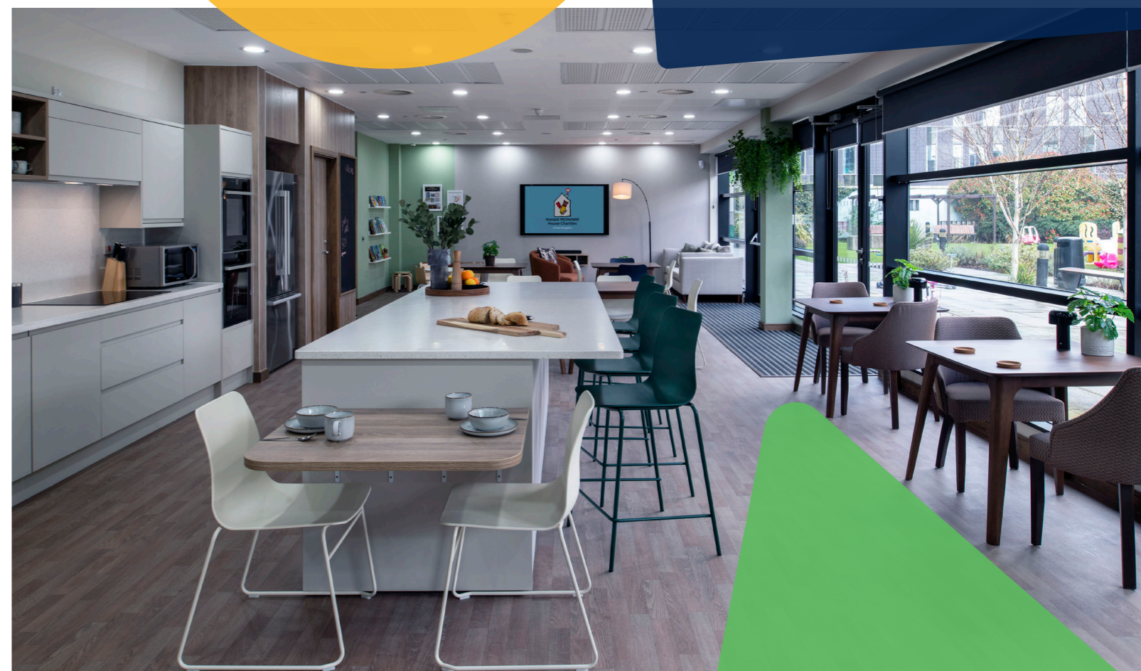
Ronald McDonald House Manchester day room.