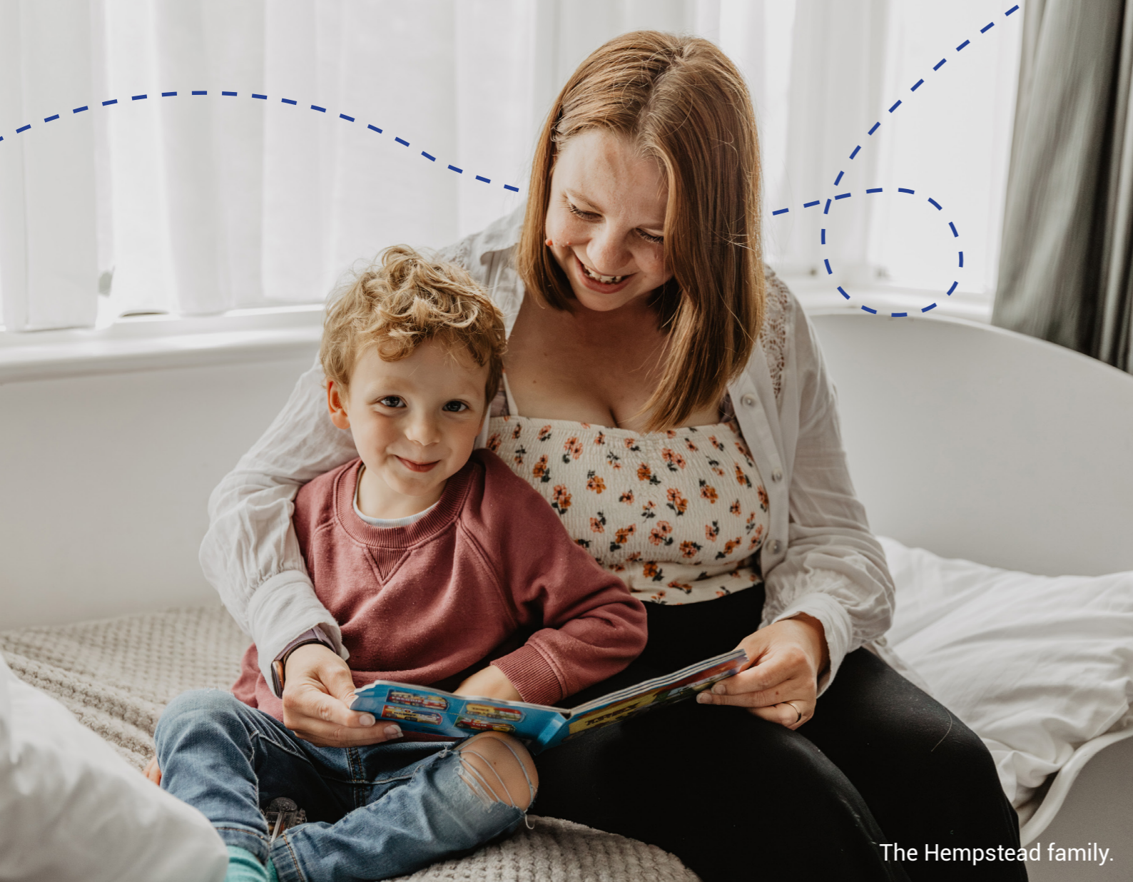
The Hempstead family.