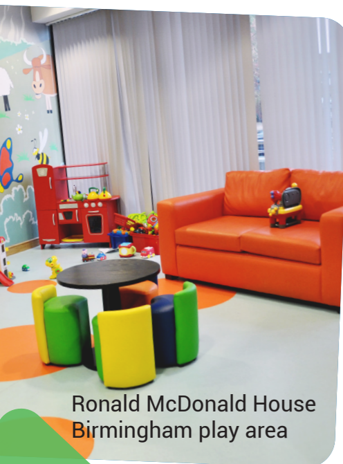
Ronald McDonald House Birmingham play area