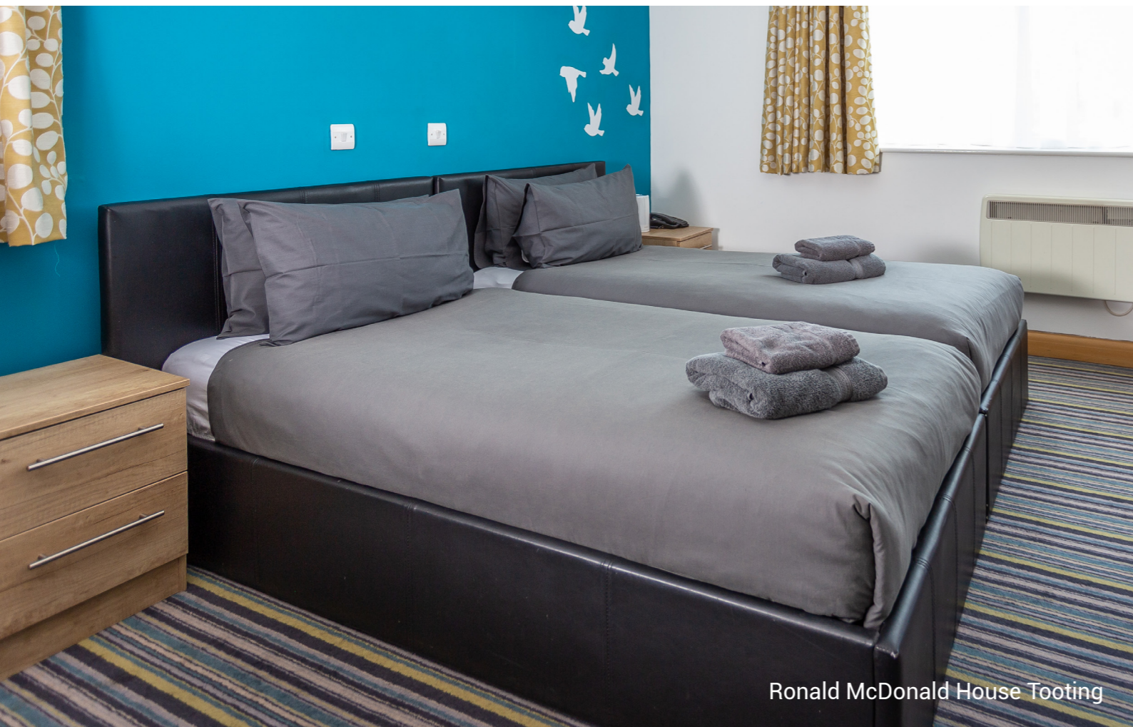
Ronald McDonald House Tooting

The challenges faced by these families are immense – parents and carers are often left exhausted. In addition to the emotional strain of worrying about their child in hospital, they are burdened with intense stress over extended periods.